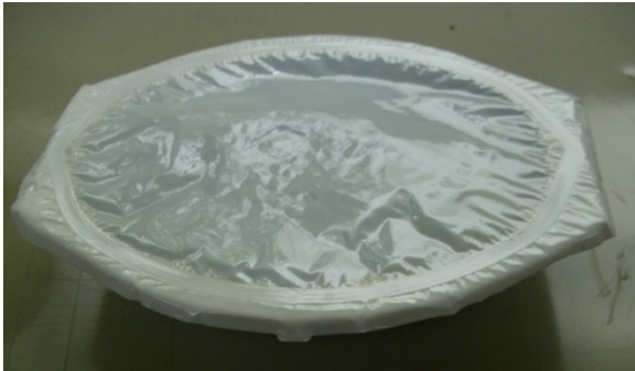
Ready-To-Eat Food (Microwaveable)

After the easy-peel film being laminated with films such as ONY(PA)、AL、PET, it can be used as sealing lid material .