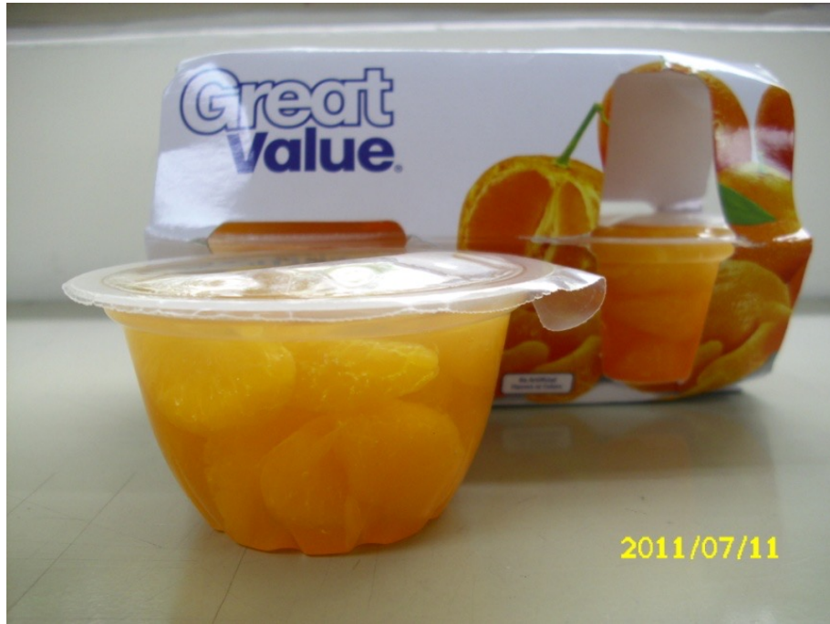
Fruit Jelly Cup